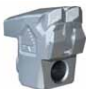
Tooth type C/3/HD (option)