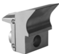
Tooth blade type C/3 (option)