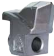
Tooth type K (option)