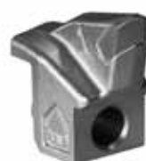
Tooth type I (option)