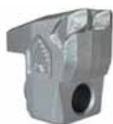
Tooth type C/3 (standard)

Data refers to the machine without options.