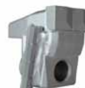
Tooth type C/3/SS (side scraper)

The technical data are indicative, not binding and are subject to modification without prior notice.