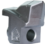
Tooth type K (option)