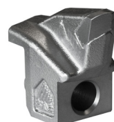
Tooth type I (option)