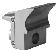
Tooth blade type C/3 (option)