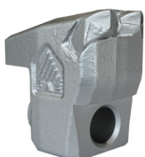
Tooth type C/3 (standard)

Data refers to the machine without options.