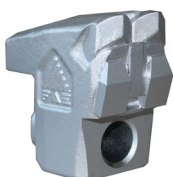
Tooth type C/3/HD (option)