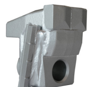
Tooth type C/3/SS (side scraper)