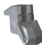
Tooth type STC/3/FP (side scraper)