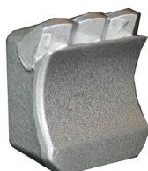
Blade type E/HD